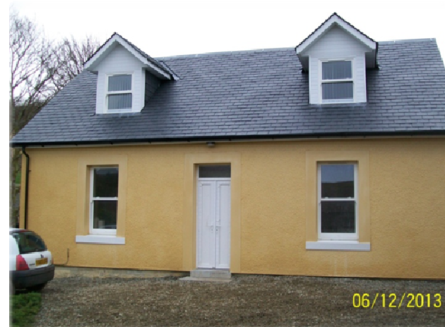
Old Schoolhouse, Clachan