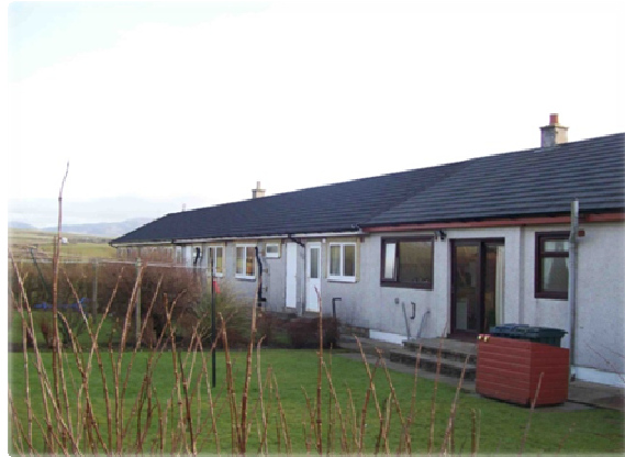
Before Work Commenced